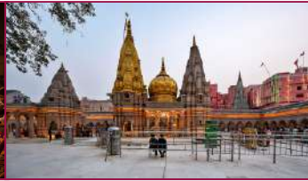
Kashi Vishwanath Dham