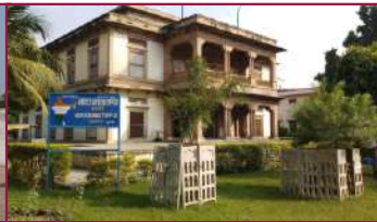
Bharat Mata Mandir