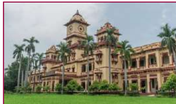
Banaras Hindu University