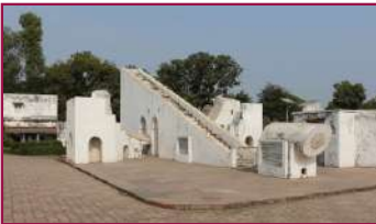
Vedhshala, Jantar Mantar